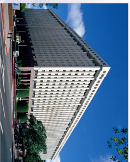
Headquarters of Formosa Plastics Group, Taipei