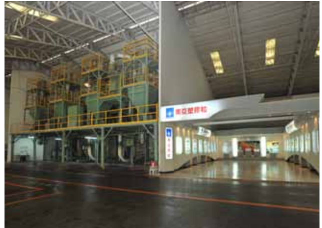
· 包裝區及展示區 Packing area & Showroom