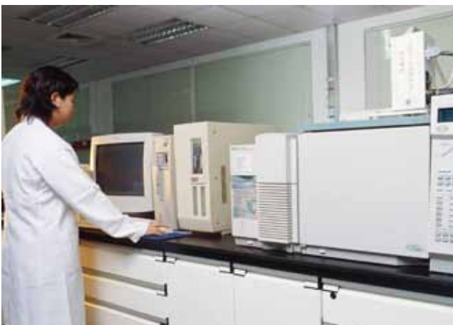
· 氣相層析儀 Gas Chromatography