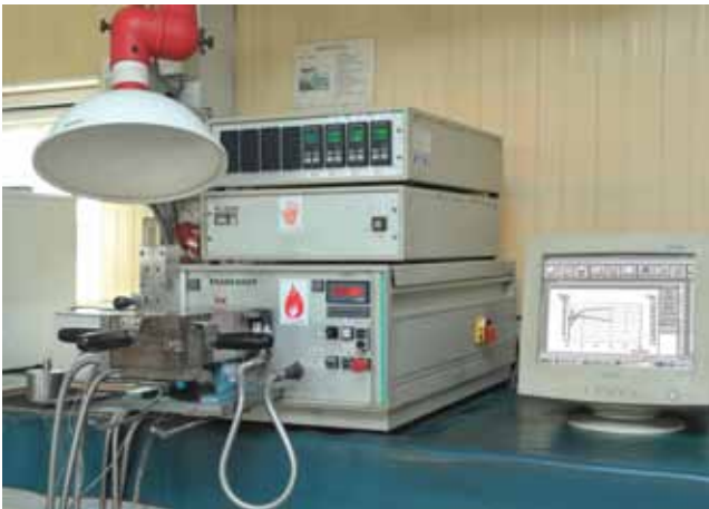
· 塑譜儀 Brabender