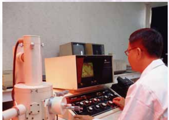
· 電子顯微鏡 Electron Microscope