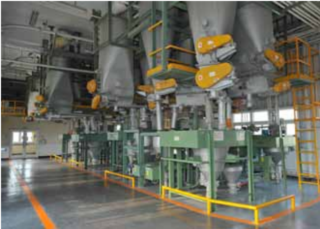
· 自動計量區 Auto Weighing area