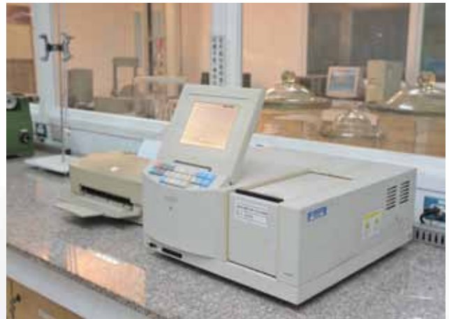
· 紫外線可見光光譜儀 UV/VIS Spectrophotometer