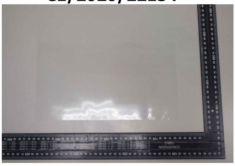
** 報告結尾(End of Report) **