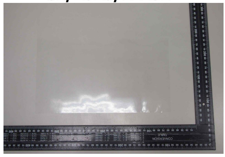
** 報告結尾(End of Report) **

This document is issued by the Company subject to its General Conditions of Service printed overleaf, available on request or accessible at <a href="http://www.sgs.com/en/Terms-and-Conditions.aspx">http://www.sgs.com/en/Terms-and-Conditions.aspx</a> and, for electronic format documents, subject to Terms and Conditions for Electronic Documents at <a href="https://www.sgs.com/en/Terms-and-conditions/terms-e-document.">https://www.sgs.com/en/Terms-and-Conditions/terms-e-document.</a> Attention is drawn to the limitation of liability, indemnification and jurisdiction issues defined therein. Any holder of this document is advised that information contained hereon reflects the Company's findings at the time of its intervention only and within the limits of client's instruction, if any. The Company's sole responsibility is to its Client and this document does not exonerate parties to a transaction from exercising all their rights and obligations under the transaction documents. This document cannot be reproduced, except in full, without prior written approval of the Company. Any unauthorized alteration, forgery or falsification of the content or appearance of this document is unlawful and offenders may be prosecuted to the fullest extent of the law. Unless otherwise stated the results shown in this test report refer only to the sample(s) tested.