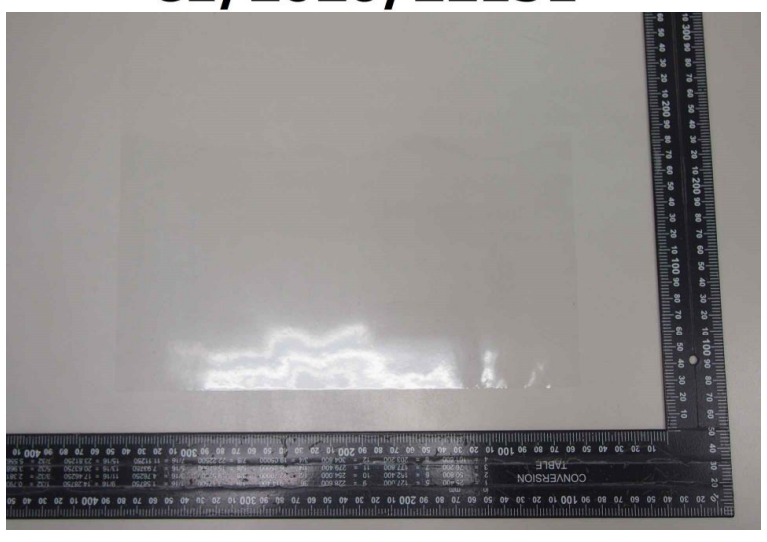
** 報告結尾 (End of Report) **

This document is issued by the Company subject to its General Conditions of Service printed overleaf, available on request or accessible at <a href="http://www.sgs.com/en/Terms-and-Conditions.aspx">http://www.sgs.com/en/Terms-and-Conditions.aspx</a> and, for electronic format documents, subject to Terms and Conditions for Electronic Documents at <a href="https://www.sgs.com/en/Terms-and-conditions/terms-e-document.">https://www.sgs.com/en/Terms-and-Conditions/terms-e-document.</a> Attention is drawn to the limitation of liability, indemnification and jurisdiction issues defined therein. Any holder of this document is advised that information contained hereon reflects the Company's findings at the time of its intervention only and within the limits of client's instruction, if any. The Company's sole responsibility is to its Client and this document does not exonerate parties to a transaction from exercising all their rights and obligations under the transaction documents. This document cannot be reproduced, except in full, without prior written approval of the Company. Any unauthorized alteration, forgery or falsification of the content or appearance of this document is unlawful and offenders may be prosecuted to the fullest extent of the law. Unless otherwise stated the results shown in this test report refer only to the sample(s) tested.